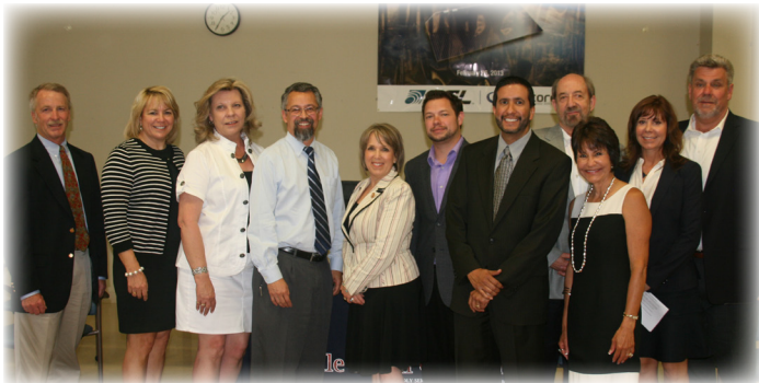
Members of the new Congressional Business Advisory Council