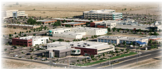
Aerial View of the SS&TP